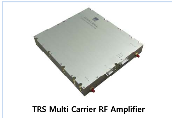
TRS Multi Carrier RF Amplifier