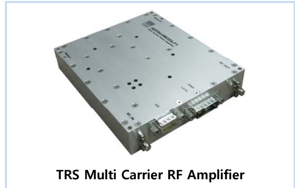
TRS Multi Carrier RF Amplifier