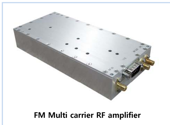
FM Multi carrier RF amplifier